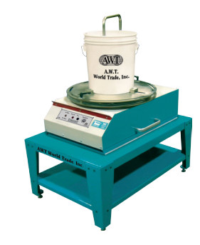
The optional stand places the Tornado at a convenient working height.

5 gal (25 Liters) Diameter: 14" (35.5 cm)