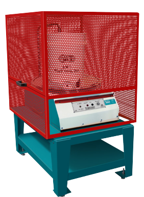
Tornado shown on optional stand and with optional safety screen